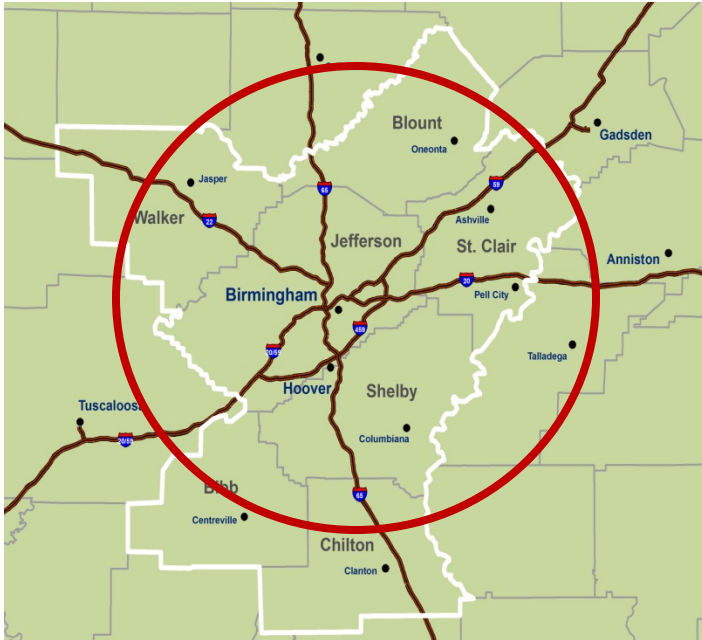
Metropolitan Birmingham Comprehensive Interstate Network